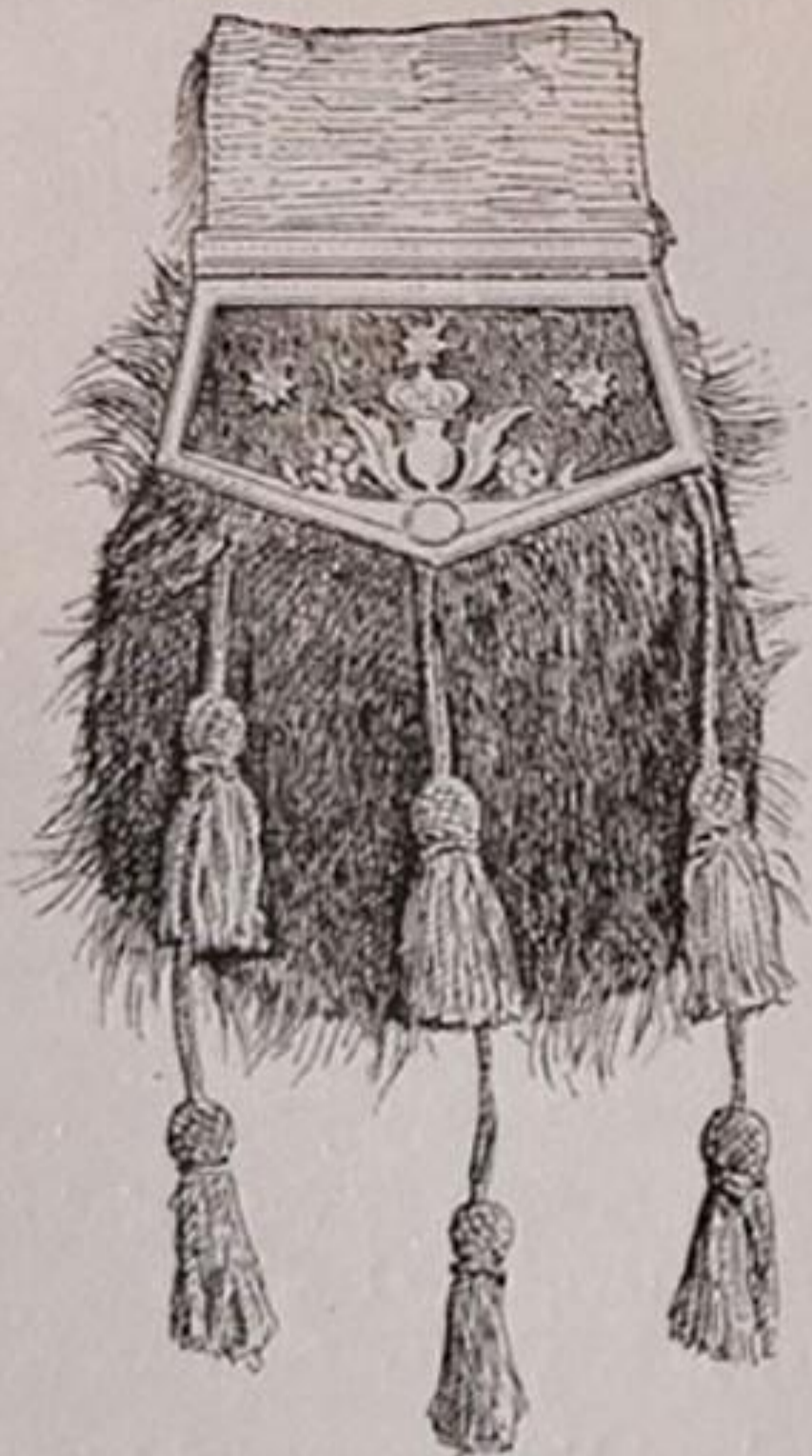
FIG. 105.—PRINCE CHARLES'S SPORRAN.