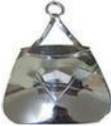
The Almoners Jewel

WM - Bro. Almoner, will you explain Relief ?